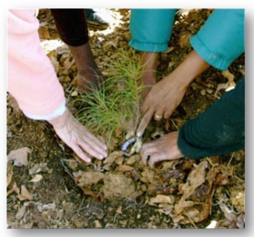
Hands planting tree.

issues of race in particular...so that \Gamma m not just a third party facilitator, but I'm actually willing to be faced with what it means to be linked to a perpetrator community. But the biggest challenge is always the issue of being a beneficiary. It's the fact that I come from a privileged, white community who systematically are still reaping the benefits of decades of structural benefits and people are NOT wanting to accept that. The racialized inequality and poverty in South