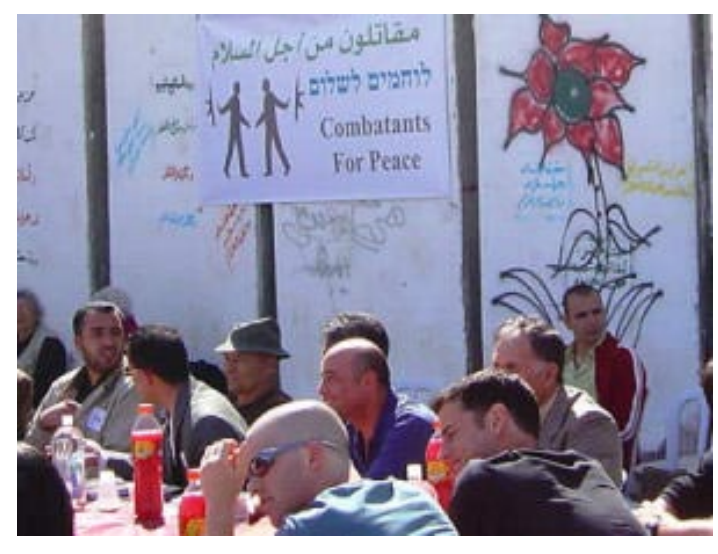
Combatants for Peace meet in shadow of Separation Wall

"There are people in the Parents Circle – Israelis – that when I listen to them it may be like for you listening to the most lovely music. They are music, they are art. I love listening to them. I engage myself there because they understood. They understood me, first of all. So, for me, The Parents Circle is a family where I find at least one place in this madness where you can feel that you are normal, with normal people."