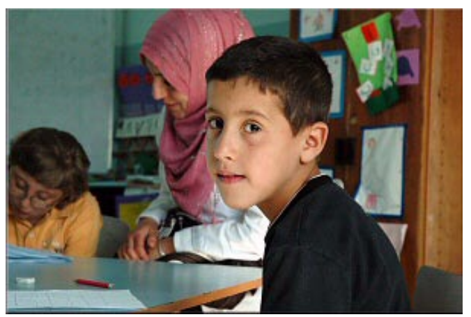
Hope Flowers Student, Bethlehem

The Hope Flowers School in Bethlehem offers a peace education curriculum that director