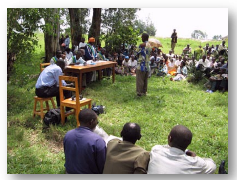
Gacaca Court, Rwanda, Photo credit: heirborne, yolasite, com

In a bold move, the government turned to the gacaca, an indigenous form of conflict resolution that literally means justice on the grass . Where the earlier form of gacaca had been informal, the Kagame government formalized and codified the process, which incorporated more that 250,000 volunteer judges, together with villagers, to adjudicate accused killers. While the judges do receive minimal legal training, the process relies heavily on the moral conscience of the community.